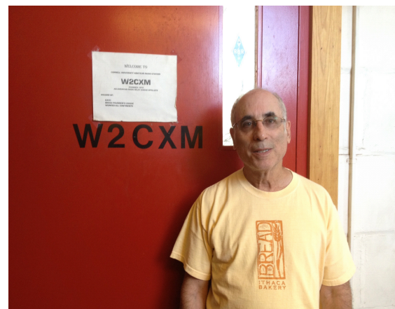
W2THU at Cornell University Amateur Radio Club, W2CXM in Barton Hall